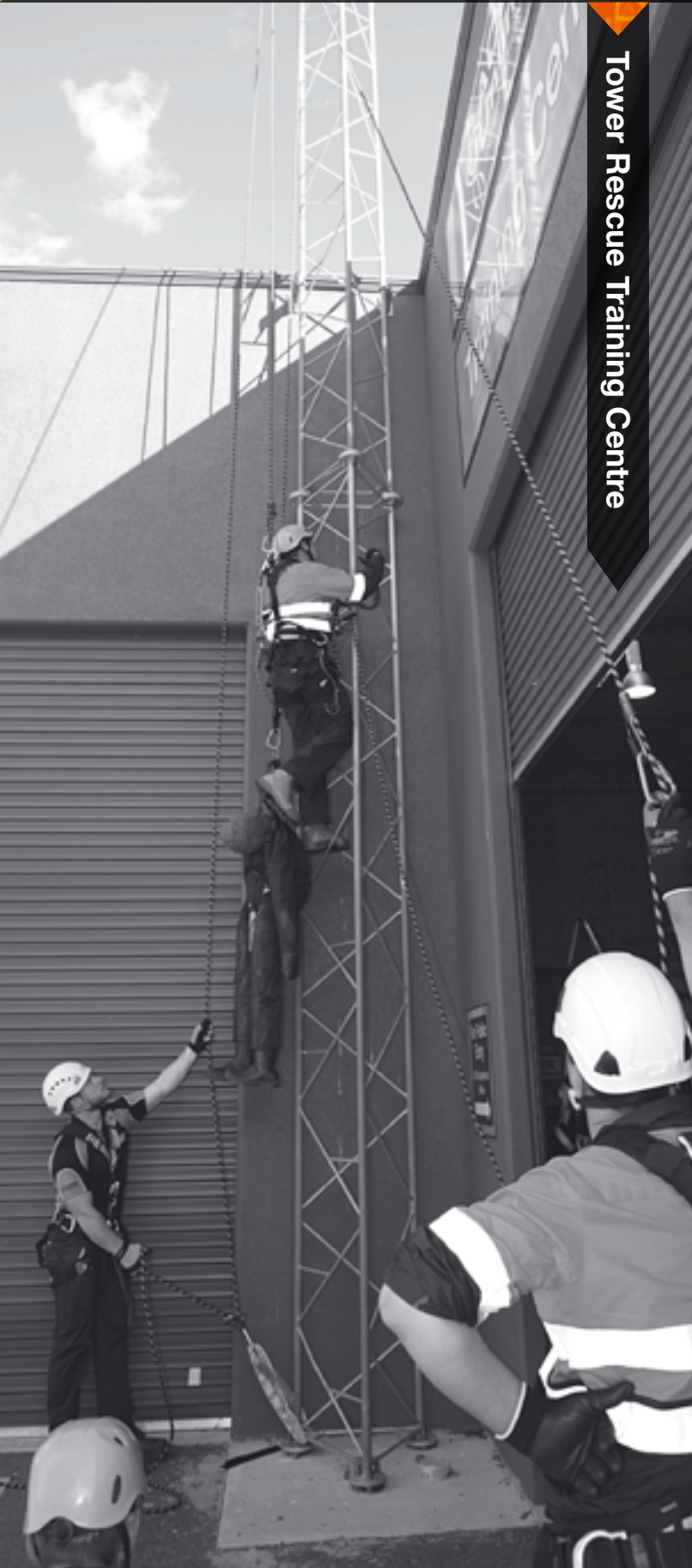
Tower Rescue Training Centre