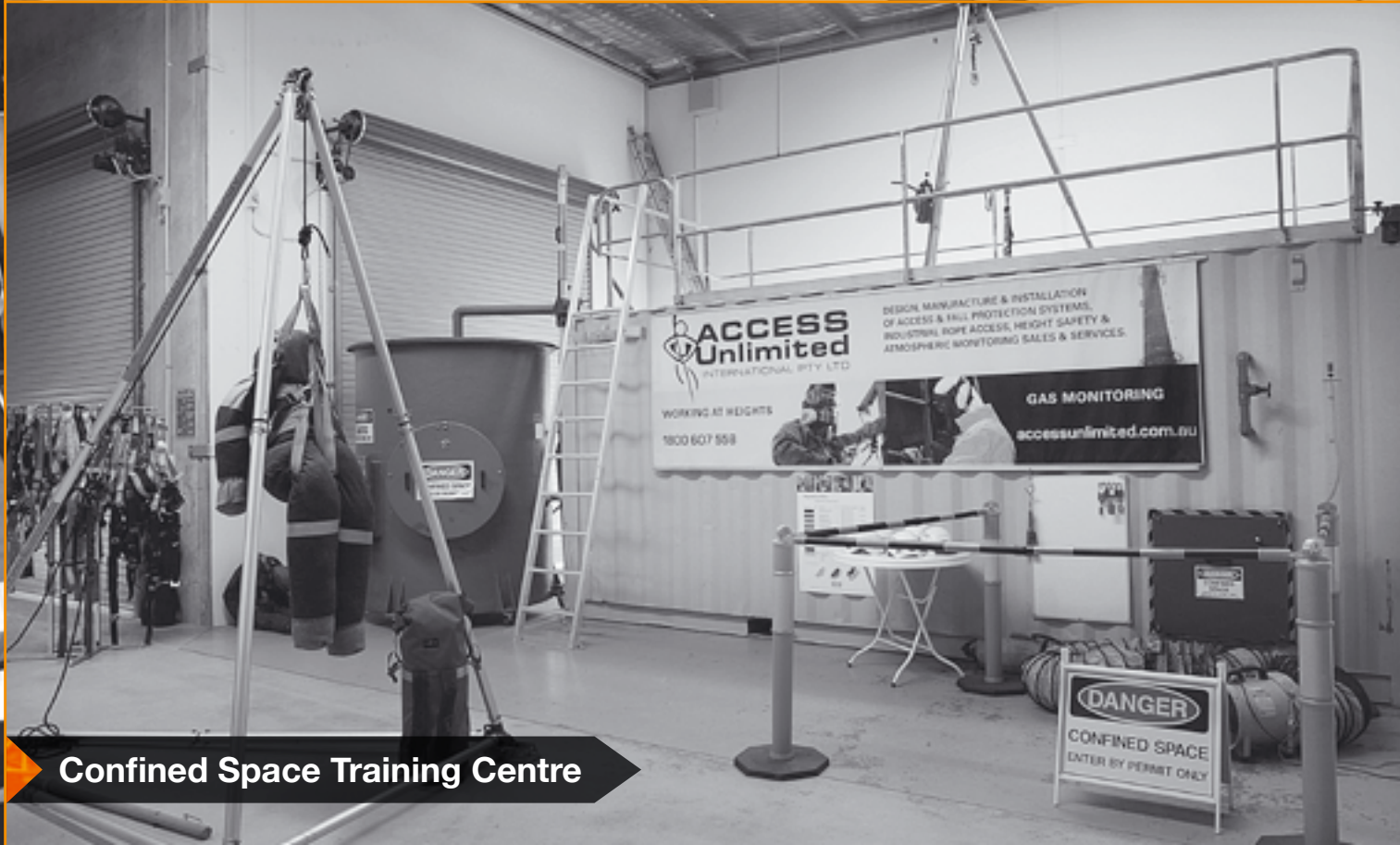
Confined Space Training Centre